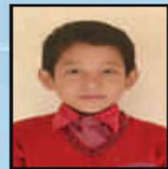
Art by: Noel Rai Class V

All these animals are the main source of income for nearly 30 billion people who live in marine and coastal areas. They catch fish, crabs, prawns, lobsters and sell these to earn money for their living. But many people around the world are polluting the sea and ocean by throwing garbage, plastics and waste materials from factories in the rivers, oceans and seas. This polluted water is affecting sea creatures and sea plants. Therefore the number of sea creatures is decreasing day by day. Every year 20% to 25% sea creatures are dying, specially the fish. Therefore, we all should lend a hand to keep the oceans and seas fresh and healthy.