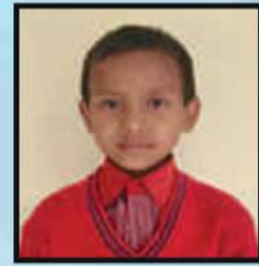
Written & Art by Lyangsong Lepcha Class V

If the basic things are taken care of the values of 'quality education' will be honoured.