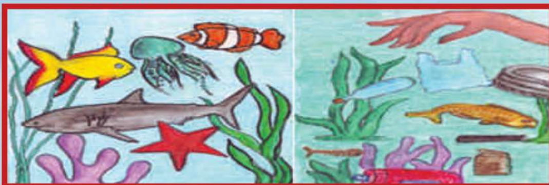
Take a Sneek Peek - Underwater!!!