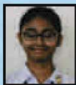
MADHURITU ROY X (i)

The coastline torn apart, letting the waters of protest Wash away the lands of ignorance, greed, and malice Today the bruised life below dared to question. And together they sang a protest song of strong detest! For years they waited, for years they forgave For years they bore the pain within, 'No More!' they cried in voices that were never heard, But today in their own abode They're going to relive! They will relive a life long forgotten, A blessed life that once gave them peace. They are dying in the abyss of smoke and ash So now they want to breathe free! They are angry, they are hurt, They don't believe in us anymore. We are running out of time, we need to repent. So let's together hand in hand make a BIG CHANGE!