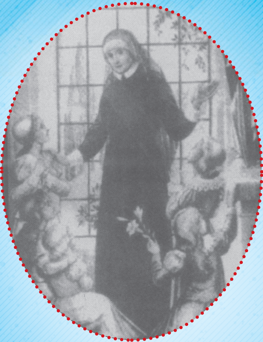
Mary Ward (1585 - 1645)

Foundress of the Institute of The Blessed Virgin Mary (Loreto)