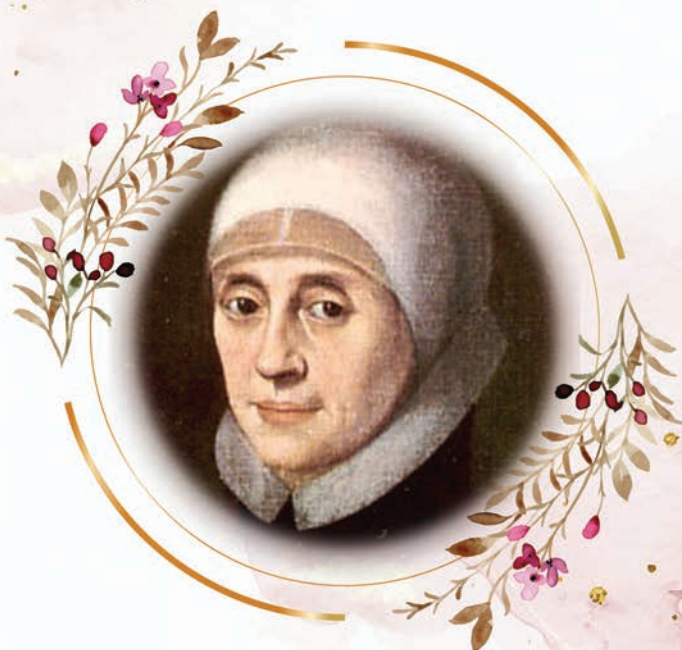
MARY WARD Foundress of I.B.V.M.